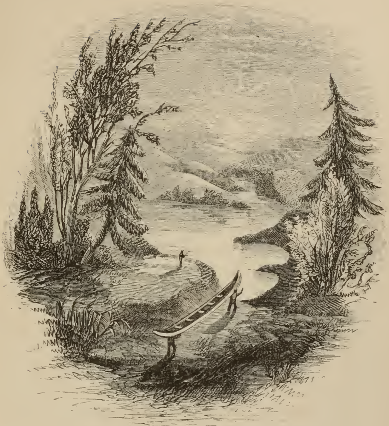
VIEW FROM THE DOG PORTAGE. Page 226.